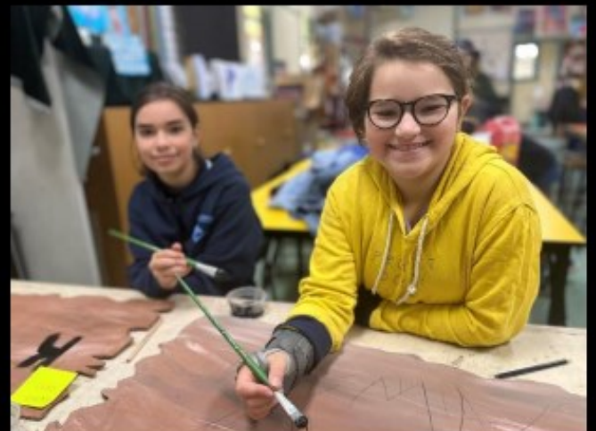
'Beware – Ogre!'