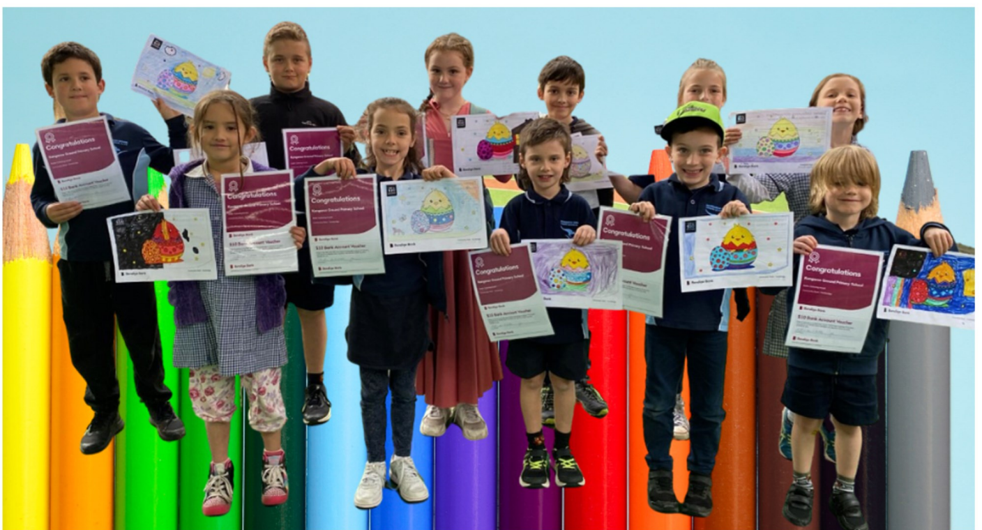
Hurstbridge Community Bank Colouring Awards